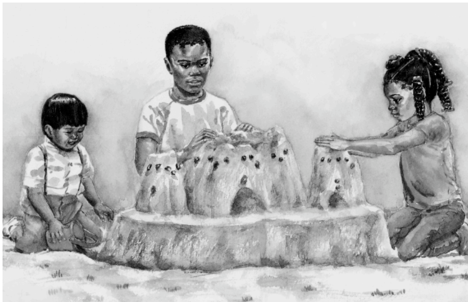
“Jamaica Tag-Along.” Text copyright © 1989 by Juanita Havill. Illustrations copyright © 1989 by Anne Sibley O'Brien. Reprinted by permission of Houghton Mifflin Co. All rights reserved.

Jamaica didn’t even mind if Ossie tagged along.